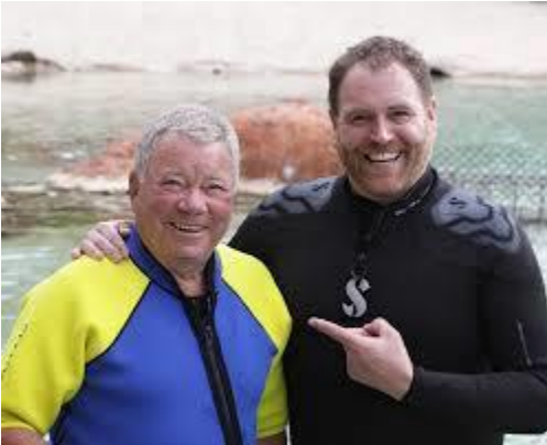
Shatner and Josh Gates.