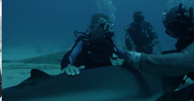
William Shatner petting a shark at Tiger Beach Bahamas.