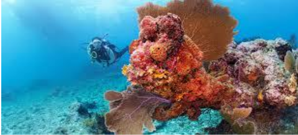
Molasses Reef Keys, Florida