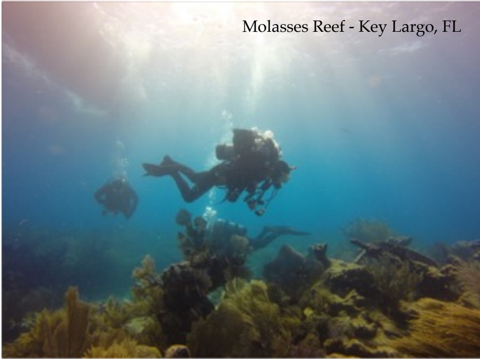
Molasses Reef - Key Largo, FL