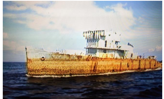
USS Strength before sinking in Panama City Beach

Hathaway Bridge Spans - The Hathaway bridge was originally built in 1929. The spans were from the old bridge that connected Panama City to Panama City Beach. There are 14 Hathaway bridge spans. The spans were sunk in 1988.